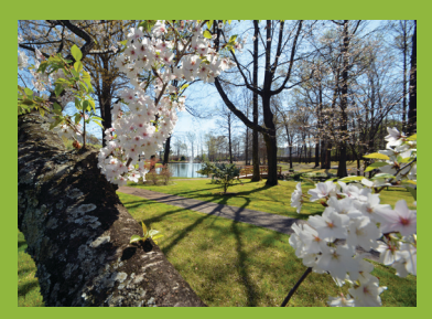
Lake Latimer & Walking Trails