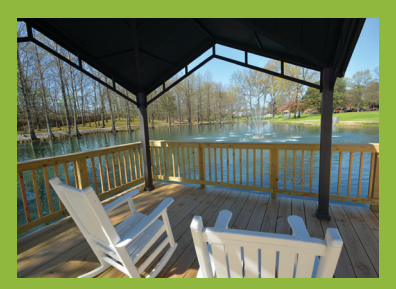
Beautiful Landcaped Campus