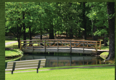
fishing lake & walking trails