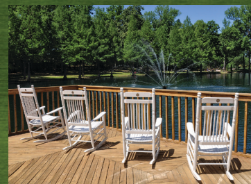
beautiful landscaped campus