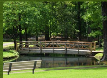
fishing lake & walking trails