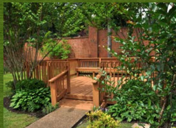
detached outdoor deck